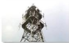
Mobile plant maintenance