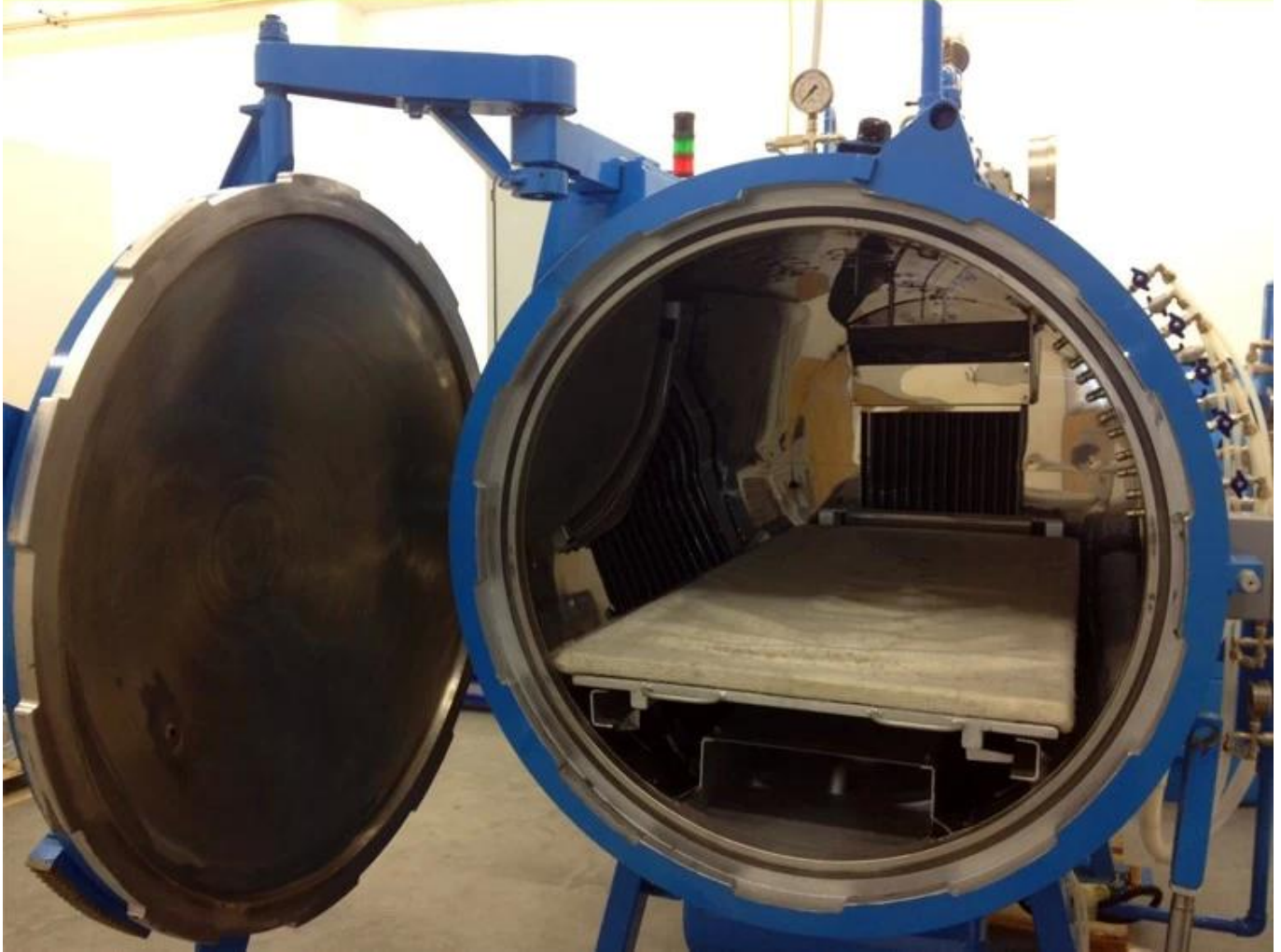
3. Trimming & Painting Area