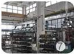
Helmet in-mold workshop