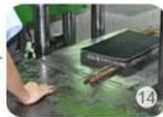
Inner padding production