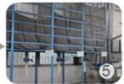
Eps raw material by different density