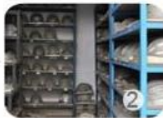
PC blister tooling