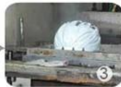
PC blister manufacture