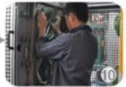
In-mold producing process