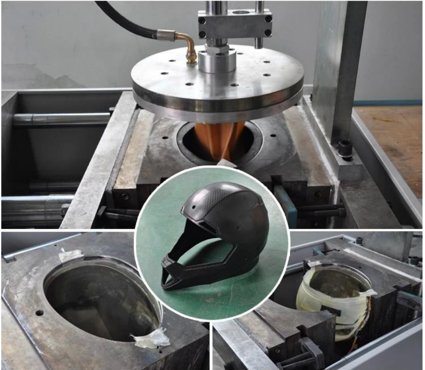
2. Autoclave Processing (Vacuum bagged)