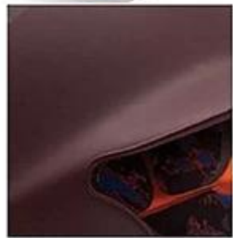
Figure 10-10. Helmet ventilation system.