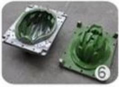
EPS in-mold tooling