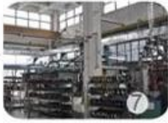
Helmet in-mold workshop