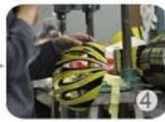
Trimming dug hole