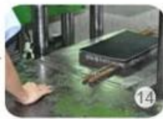
Inner padding production