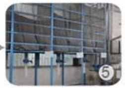
Eps raw material by different density