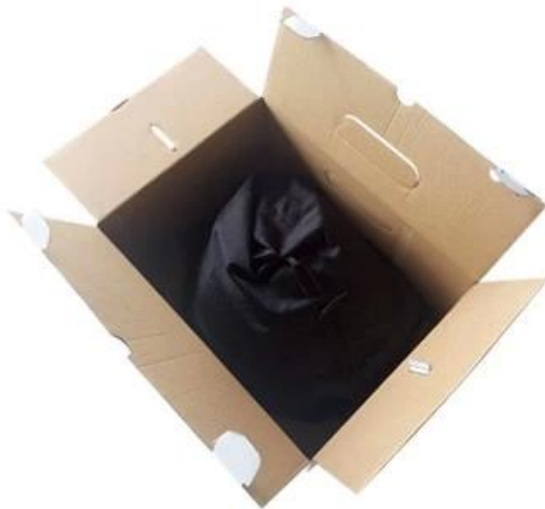
Cloth bag + Box Packaging White Box size: 31*23*18cm