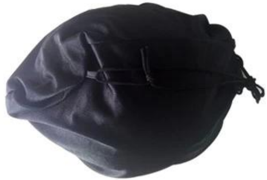
Soft cloth bag