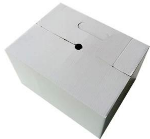
9 boxes/carton Master carton: 68*32*54cm