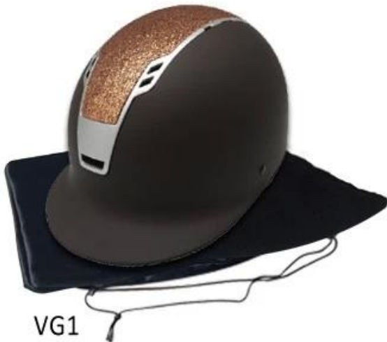
VG1 CE EN 1384 : 2017 Certificate