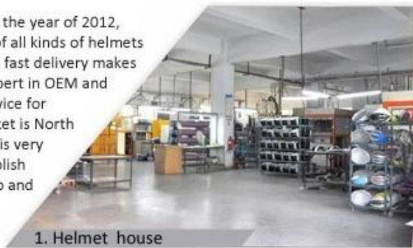
1. Helmet house

Shenzhen Aurora Sports Goods Co., LTD established in the year of 2012, more than 22 years experience. Expert in production of all kinds of helmets for different sports. Excellent quality, reasonable price, fast delivery makes us get very good reputation among our customers. Expert in OEM and ODM orders. Our skilled R&D team offers one stop service for throughout customers. 99% export and our main market is North America, European, Australia, Japan etc. Your enquiry is very welcomed and we will try our utmost to help you establish solid market. We are looking for long term relationship and get win win situation.