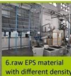
6. raw EPS material with different density