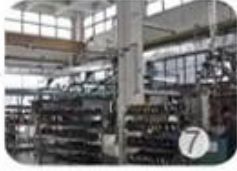
Helmet in-mold workshop