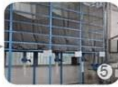
Eps raw material by different density