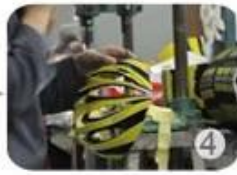
Trimming dug hole