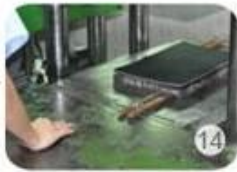
Inner padding production