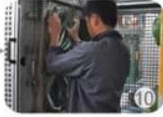
In-mold producing process