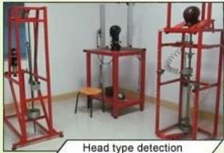
Head type detection