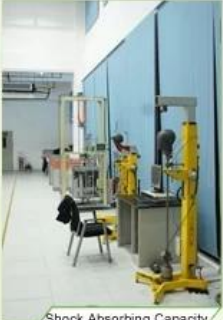
Shock Absorbing Capacity