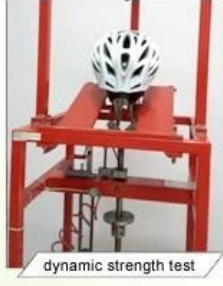
dynamic strength test