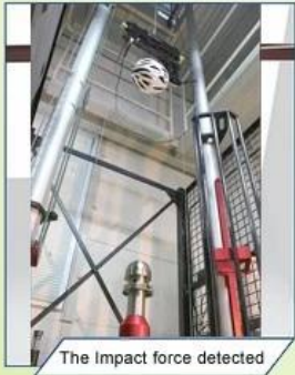
The Impact force detected

Every manufacturing steps at AURORA follows adhere to strict quality parameters and focus on quality throughout the each stagesinvolved. All raw material and semi finished goods at AURORA pass strict quality control. The finished product, helmets at Aurora is then tested and qualified to export to the world.