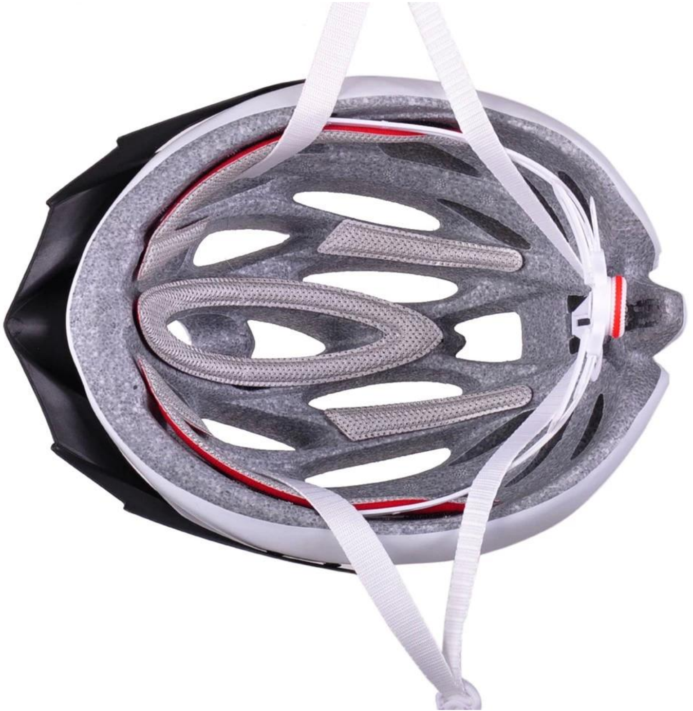
Figure 1 shows the internal structure of the helmet.