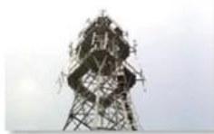
Mobile plant maintenance