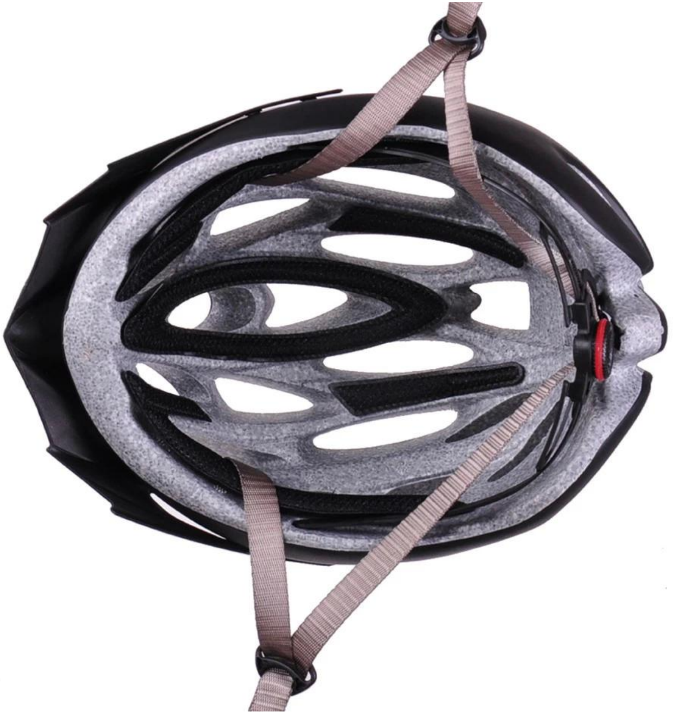
Figure 1 shows the internal structure of the helmet, including the shell, liner, and straps.