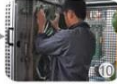
In-mold producing process