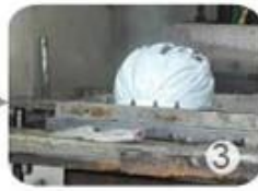
PC blister manufacture