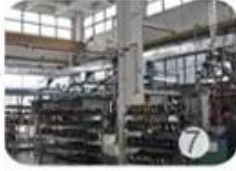
Helmet in-mold workshop