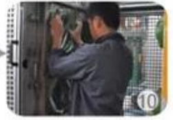
In-mold producing process