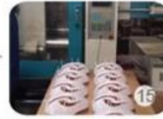
Plastic injection workshop