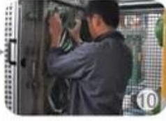
In-mold producing process