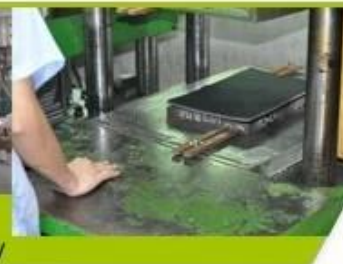
7. Inner padding Production