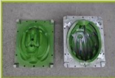
5. EPS In-mold tool