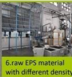
6. raw EPS material with different density