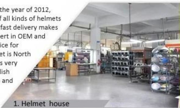
1. Helmet house

Shenzhen Aurora Sports Goods Co., LTD established in the year of 2012, more than 22 years experience. Expert in production of all kinds of helmets for different sports. Excellent quality, reasonable price, fast delivery makes us get very good reputation among our customers. Expert in OEM and ODM orders. Our skilled R&D team offers one stop service for throughout customers. 99% export and our main market is North America, European, Australia, Japan etc. Your enquiry is very welcomed and we will try our utmost to help you establish solid market. We are looking for long term relationship and get win win situation.