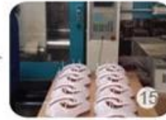
Plastic injection workshop