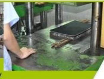
7. Inner padding Production