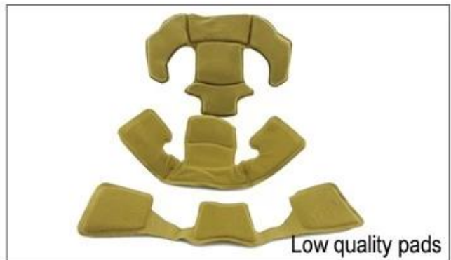
Low quality pads