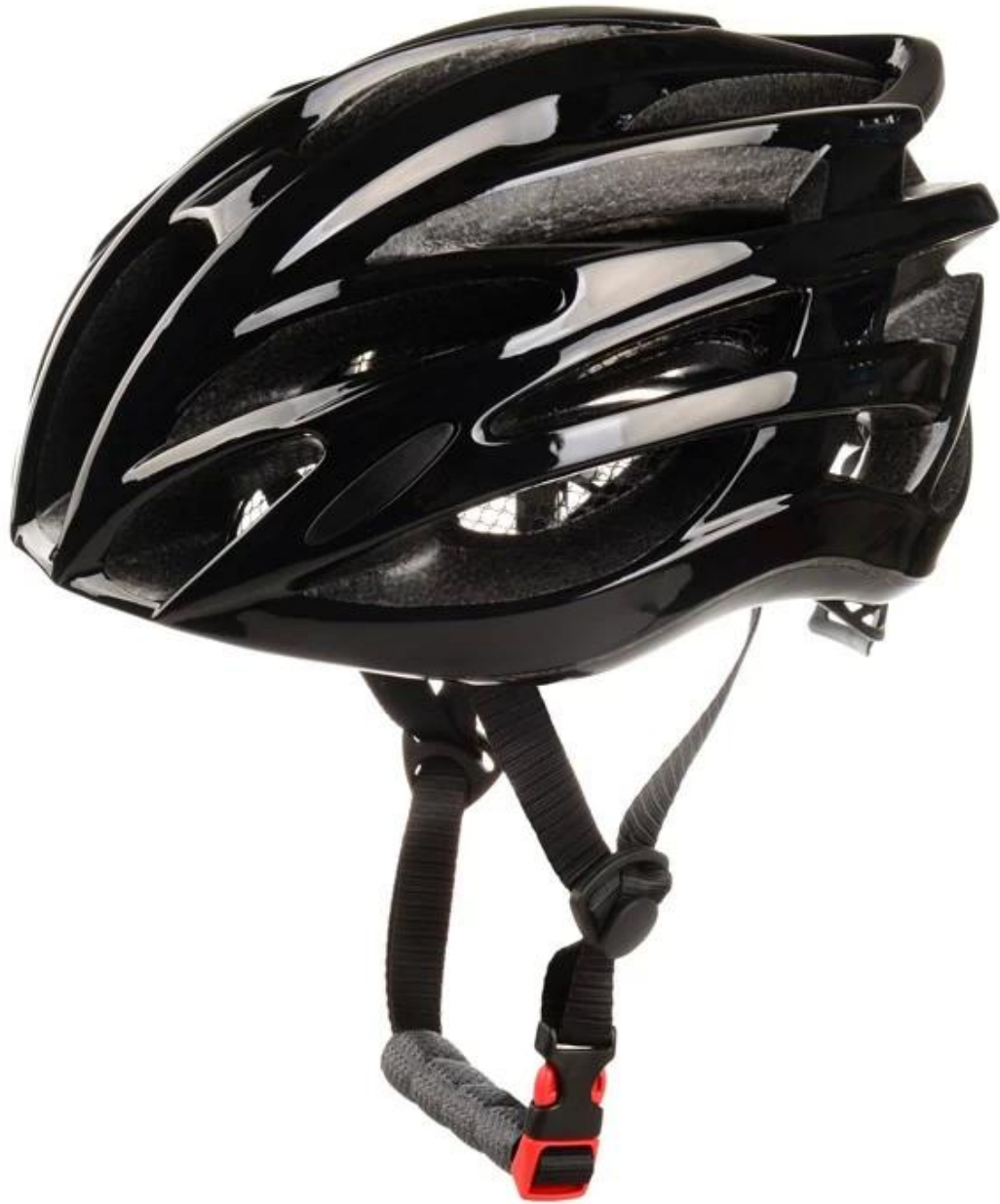
Figure 1 shows the helmet design and its components.