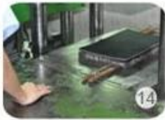
Inner padding production