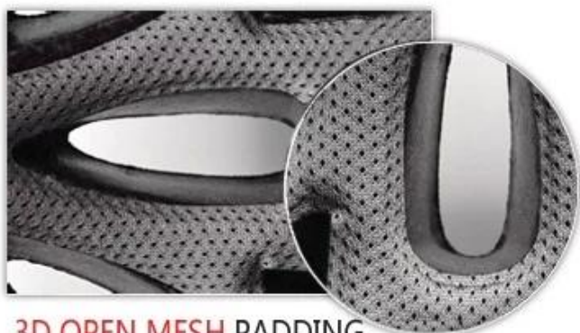
3D OPEN MESH PADDING