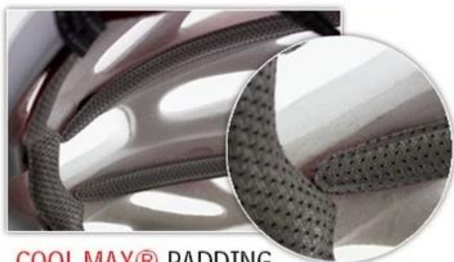
COOL MAX® PADDING