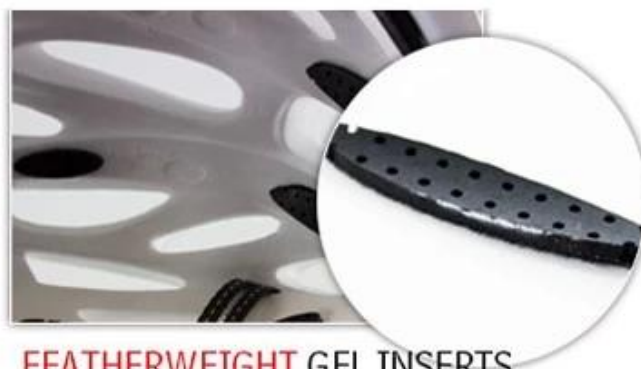
FEATHERWEIGHT GEL INSERTS