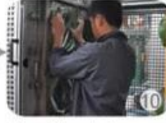
In-mold producing process