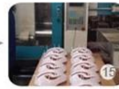
Plastic injection workshop