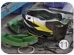
semi-finished In-mold helmet