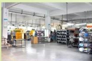
1. Helmet house

established in the year of 2012, more than 22 years experience. Expert in production of all kinds of helmets for different sports. Excellent quality, reasonable price, fast delivery makes us get very good reputation among our customers. Expert in OEM and ODM orders. Our skilled R&D team offers one stop service for throughout customers. 99% export and our main market is North America, European, Australia, Japan etc. Your enquiry is very welcomed and we will try our utmost to help you establish solid market. We are looking for long term relationship and get win win situation.