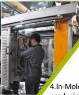
4. In-Mold producing process