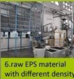
6. raw EPS material with different density