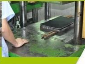
7. Inner padding Production