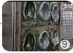
9 In-mold tooling