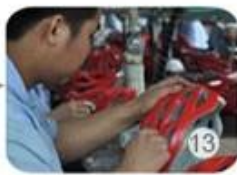
13 Helmet grinding