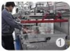
1 Silk screen