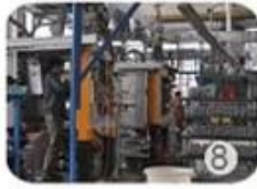
8 In-mold machines