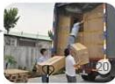
20 Installed counters