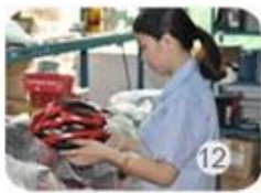
12 IQC inspection