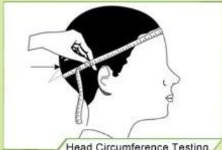
Head Circumference Testing