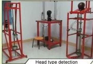
Head type detection