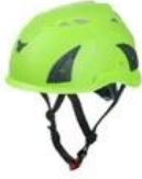
Lime green pantone 375 C