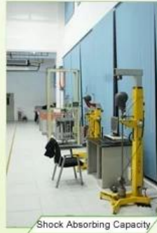
Shock Absorbing Capacity