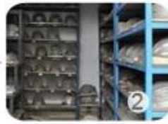
PC blister tooling