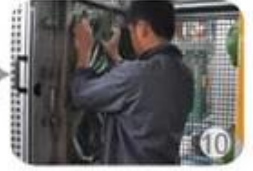
In-mold producing process