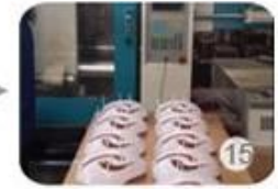
Plastic injection workshop