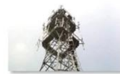
Mobile plant maintenance