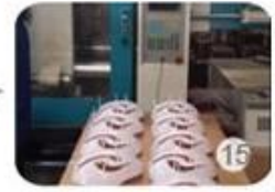
Plastic injection workshop