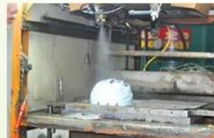
3. PC blister tooling