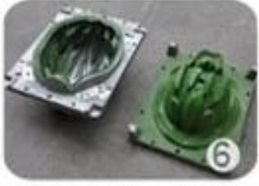
EPS in-mold tooling