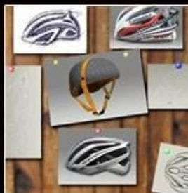
1. Trend predictions