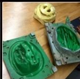
3. Development Stage