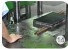
Inner padding production