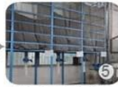
Eps raw material by different density