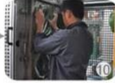
In-mold producing process