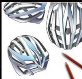
2. Conception Ideation