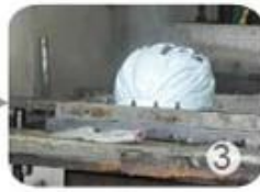
PC blister manufacture