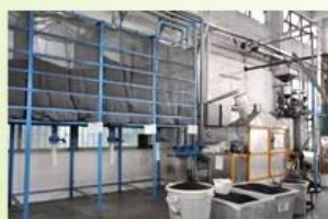
6. raw EPS material