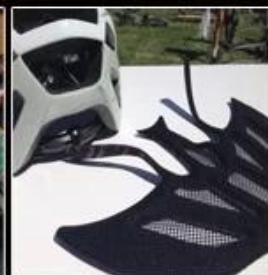
4. Final Production Stage