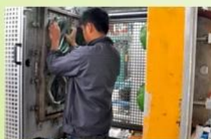
4. In-Mold producing process