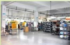
1. Helmet house

established in the year of 2012, more than 22 years experience. Expert in production of all kinds of helmets for different sports. Excellent quality, reasonable price, fast delivery makes us get very good reputation among our customers. Expert in OEM and ODM orders. Our skilled R&D team offers one stop service for throughout customers. 99% export and our main market is North America, European, Australia, Japan etc. Your enquiry is very welcomed and we will try our utmost to help you establish solid market. We are looking for long term relationship and get win win situation.