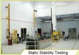
Static Stability Testing

Every manufacturing steps at AURORA follows adhere to strict quality parameters and focus on quality throughout the each stagesinvolved. All raw material and semi finished goods at AURORA pass strict quality control. The finished product, helmets at Aurora is then tested and qualified to export to the world.