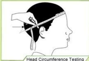
Head Circumference Testing