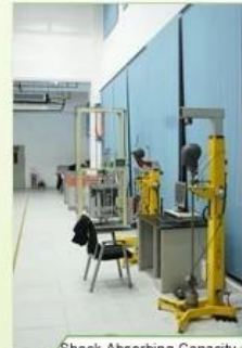
Shock Absorbing Capacity