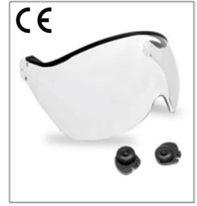
New deve loped clear visor EN266