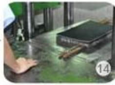
Inner padding production