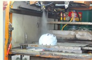
3. PC blister tooling