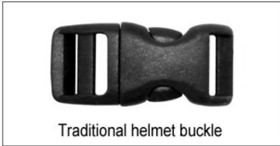
Traditional helmet buckle