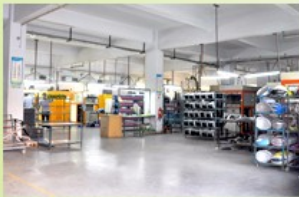
1. Helmet house

established in the year of 2012, more than 22 years experience. Expert in production of all kinds of helmets for different sports. Excellent quality, reasonable price, fast delivery makes us get very good reputation among our customers. Expert in OEM and ODM orders. Our skilled R&D team offers one stop service for throughout customers. 99% export and our main market is North America, European, Australia, Japan etc. Your enquiry is very welcomed and we will try our utmost to help you establish solid market. We are looking for long term relationship and get win win situation.