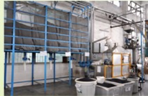
6. raw EPS material