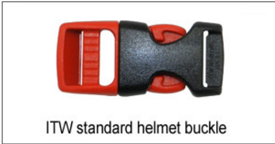
ITW standard helmet buckle