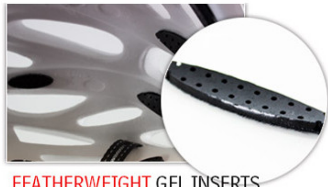
FEATHERWEIGHT GEL INSERTS

Our helmets are designed to provide maximum protection and comfort. We offer a variety of padding options to suit your needs. - View our padding options . We have a wide range of padding options to choose from.