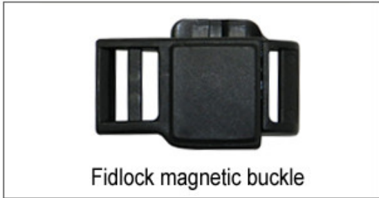
Fidlock magnetic buckle

We can also customize various colors buckle.