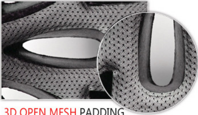
3D OPEN MESH PADDING