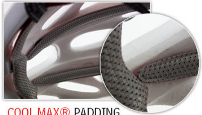
COOL MAX® PADDING