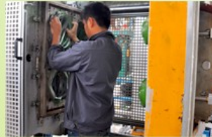
4. In-Mold producing process