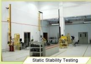
Static Stability Testing

Every manufacturing steps at AURORA follows adhere to strict quality parameters and focus on quality throughout the each stages involved. All raw material and semi finished goods at AURORA pass strict quality control. The finished product, helmets at Aurora is then tested and qualified to export to the world.