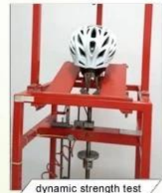
dynamic strength test