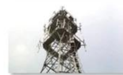
Mobile plant maintenance