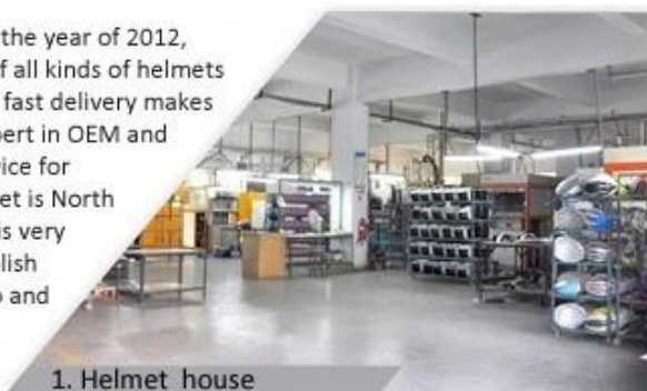
1. Helmet house

Shenzhen Aurora Sports Goods Co., LTD established in the year of 2012, more than 22 years experience. Expert in production of all kinds of helmets for different sports. Excellent quality, reasonable price, fast delivery makes us get very good reputation among our customers. Expert in OEM and ODM orders. Our skilled R&D team offers one stop service for throughout customers. 99% export and our main market is North America, European, Australia, Japan etc. Your enquiry is very welcomed and we will try our utmost to help you establish solid market. We are looking for long term relationship and get win win situation.