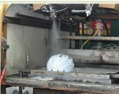
3. PC blister tooling