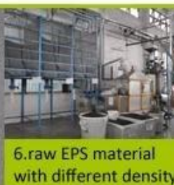
6. raw EPS material with different density