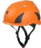
Orange pantone 165 C