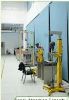
Shock Absorbing Capacity