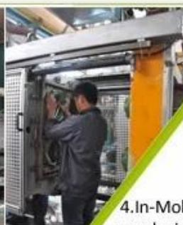
4. In-Mold producing process