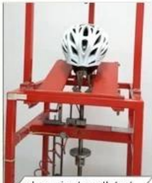
dynamic strength test