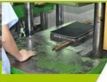
7. Inner padding Production