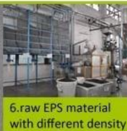
6. raw EPS material with different density