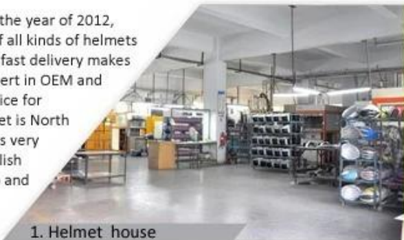
1. Helmet house

Shenzhen Aurora Sports Goods Co., LTD established in the year of 2012, more than 22 years experience. Expert in production of all kinds of helmets for different sports. Excellent quality, reasonable price, fast delivery makes us get very good reputation among our customers. Expert in OEM and ODM orders. Our skilled R&D team offers one stop service for throughout customers. 99% export and our main market is North America, European, Australia, Japan etc. Your enquiry is very welcomed and we will try our utmost to help you establish solid market. We are looking for long term relationship and get win win situation.