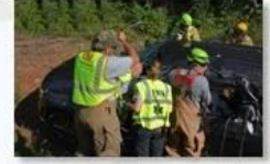
Rescue and evacuation