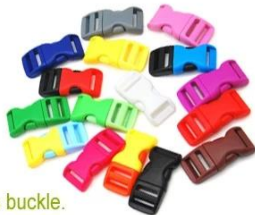
Fidlock magnetic buckle

We can also customize various colors buckle.