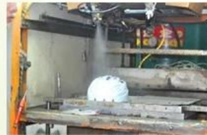
3. PC blister tooling