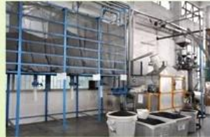
6. raw EPS material