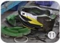
semi-finished In-mold helmet