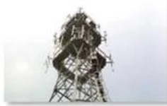
Mobile plant maintenance