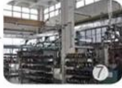
Helmet in-mold workshop