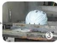
PC blister manufacture