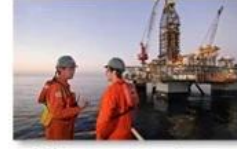
Offshore oil and gas