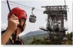
Cable car maintenance