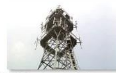
Mobile plant maintenance