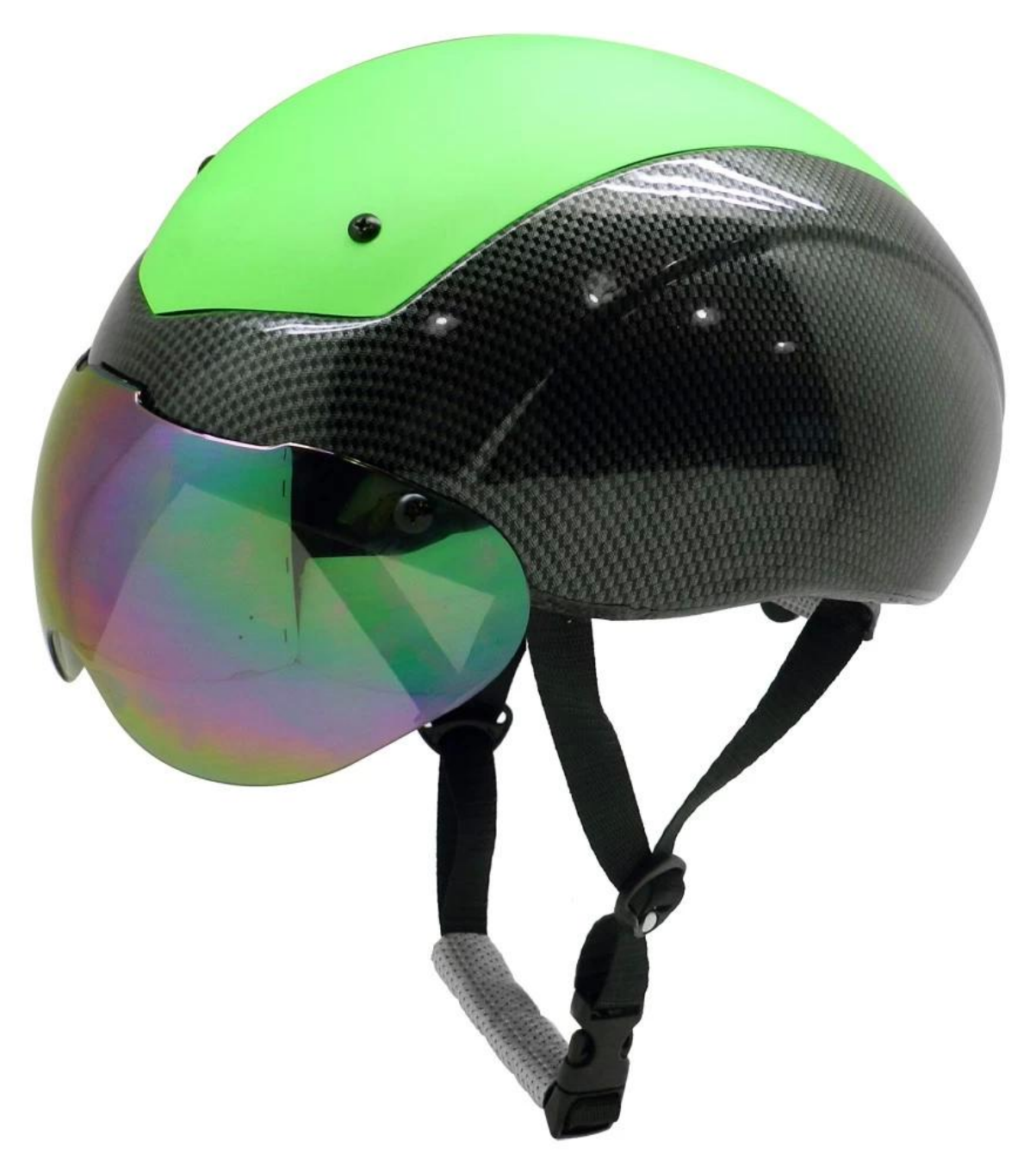
The knowledge of helmet headform: